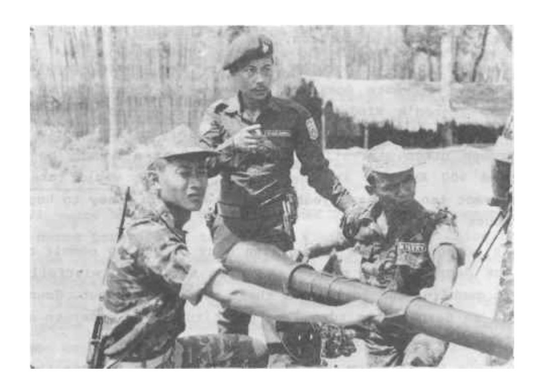
WNA (WA) officers taking weapons Trg. at KNLA HQ.

There is no other remedy that will cure the country of the malady that has plagued it for 25 years now. The situation can only get worse. Only armed resistance of the oppressed ethnic nationals unto victory would cure the country of this abominable malady.