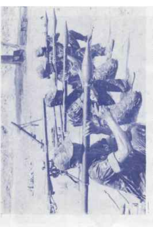
WNA (WA) troops at Heavy Wespons Trg. at KNLA HQ.