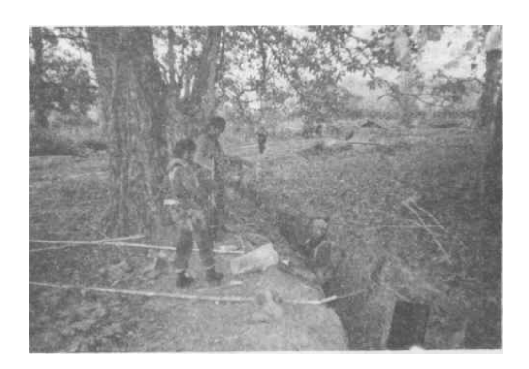
Kadaingti enemy camp after being occupied by KNLA lately

The word "maje" comes from the Apa Tani tribe of northern Assam. It is their term for Tibetan bells which they venerate. In Eastern thought, the bell symbolizes enlightenment, and its Western meaning is alarm-sounding, Also, in Burmese, "ma-je" means an older sister, who looks after her other siblings.