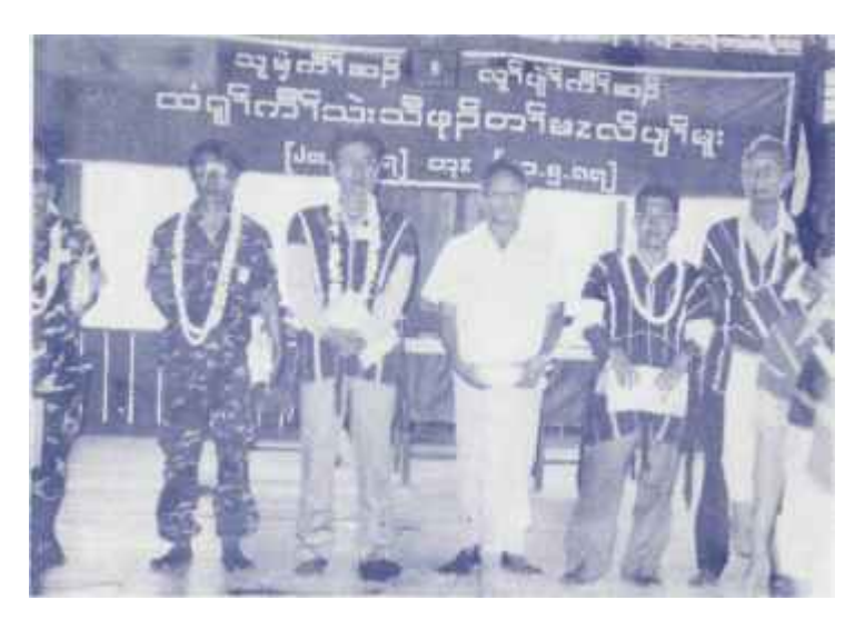
Teachers and staff of 1981 Me Tarit Vol. Trg. Course after being garlanded.