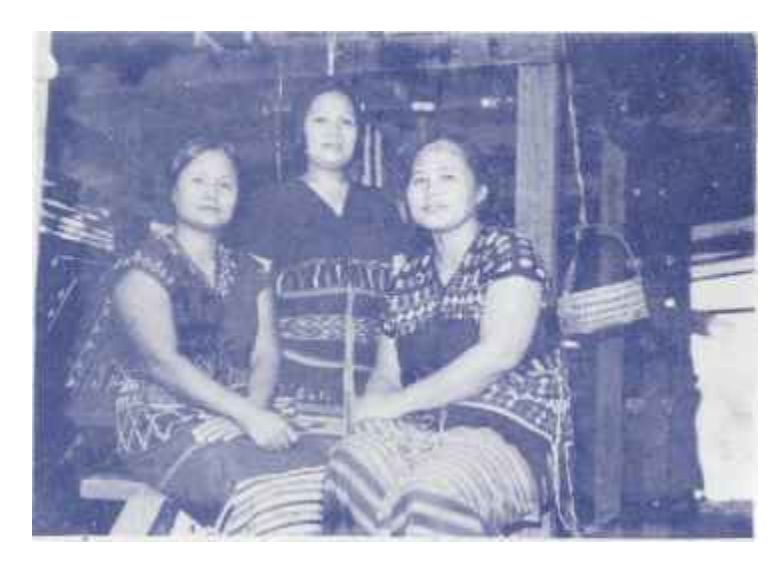
Tavoy/Mergui District KWO Leaders.