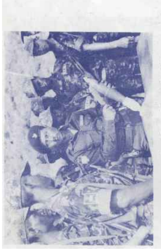
WNA (WA) Troops taking Heavy Weapons Trg. at KNLA GHQ.