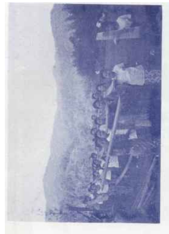
Women trainees of Me Turit Vol. Trg. Course at Fatigue work.