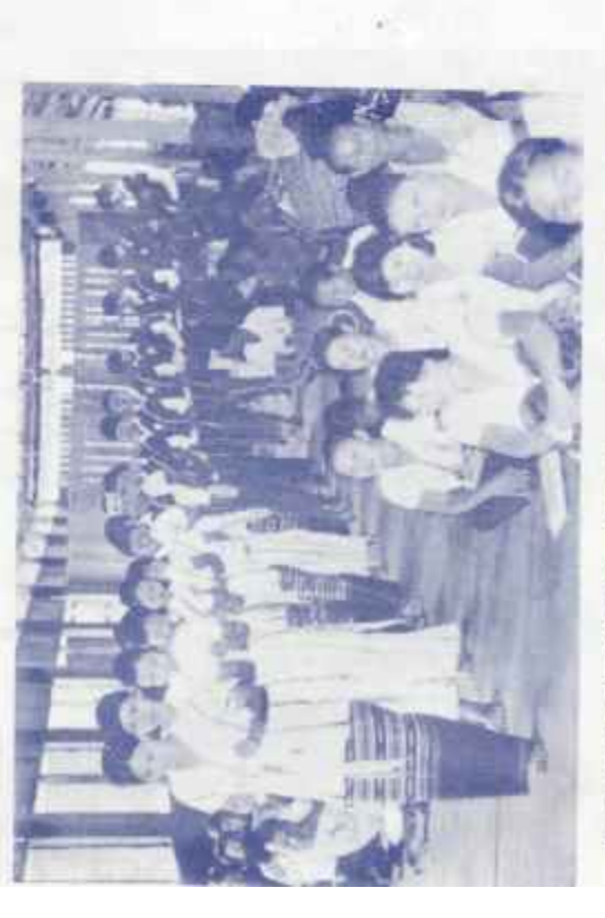
Praintees of Me Tarit Vol. Trg. class lining up to honour their teachers.