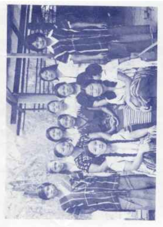
Instructors and Trainees of Mergul-Taroy weaving school.