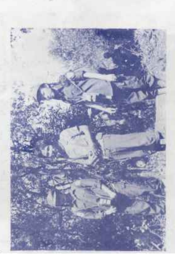
Radto mechanic (centre) with (2) women operators who accompanied the organization team to Bu Tho Township