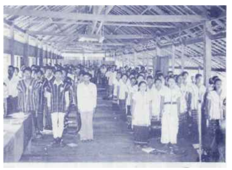
1987 Me Tarit Vol. Trg. Trainees at the Closing ceremony.