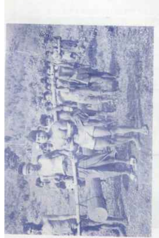
Men Trainees of Me Varit Vol. Trg. course at Failgue work,