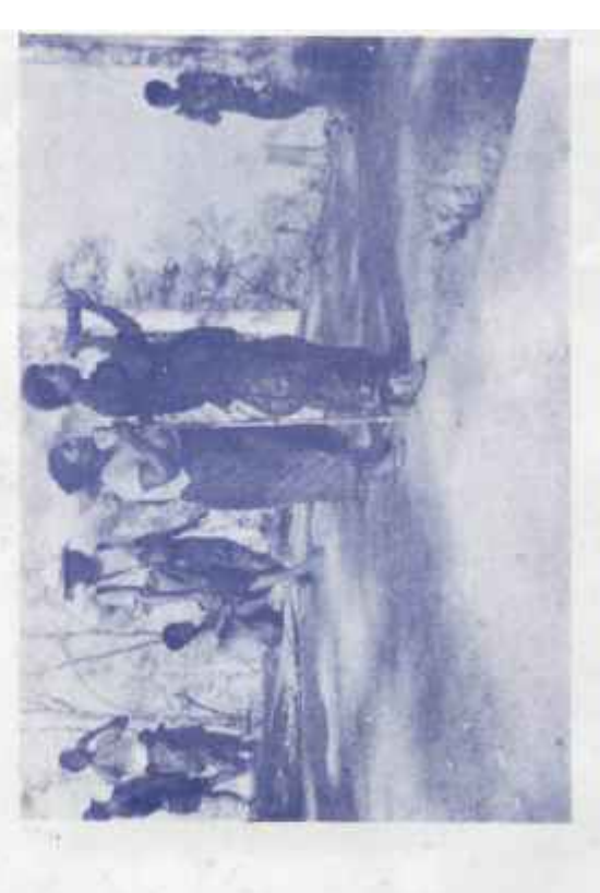
Central KWO leaders at Kawlawalu Piak viewing the beautiful Salwen Valleys